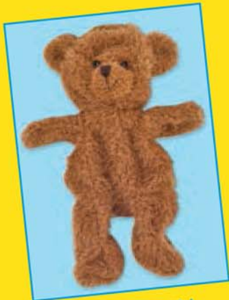
TAKE THE SKIN....