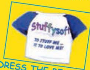
DRESS THE BEAR....