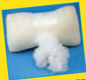
ADD THE FIBER FILL....