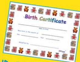
...AND COMPLETE THE CERTIFICATE!

THAT'S ALL IT TAKES! • NO SEWING! • NO STUFFING MACHINES!