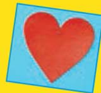
INSERT THE HEART....