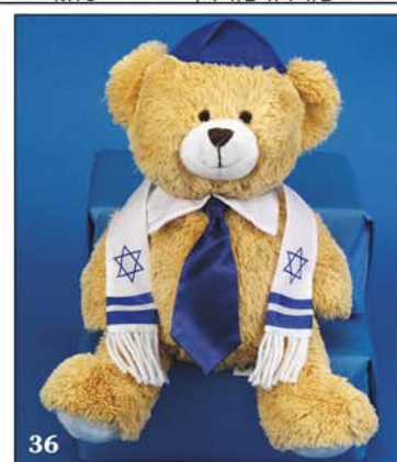
36 TALLIS / PRAYER SHAWL • YARMULKE