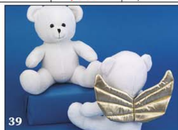
39 ANGEL WINGS