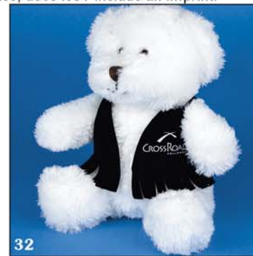
32 WESTERN VEST