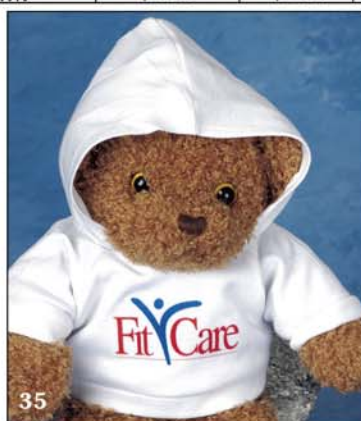
35 HOODED SWEATSHIRT