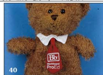
40 COLLAR TIE