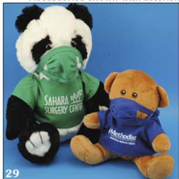
29 DOCTOR SCRUB SUIT

BOUGHT ALONE price, does NOT include an imprint.